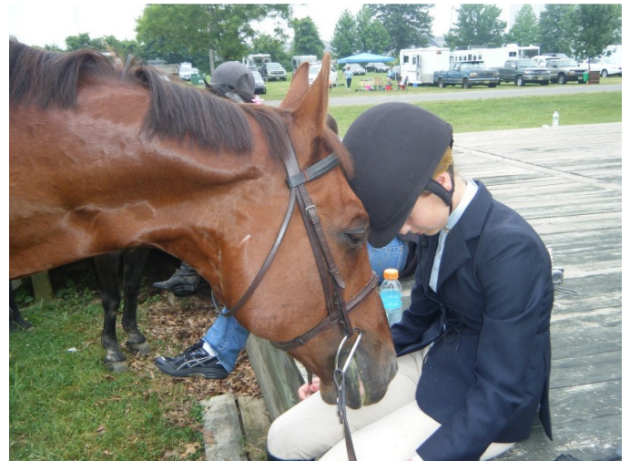
"Taking a break between classes"

2011 Perpetual Trophies will be awarded, at the banquet, to the Division Champion and special award winners. A CJHA contract must be signed, that evening, stating that the winner will return the trophy the Fall of 2012, or a fee of $250 will be imposed. Any minor must have a parent sign the contract.