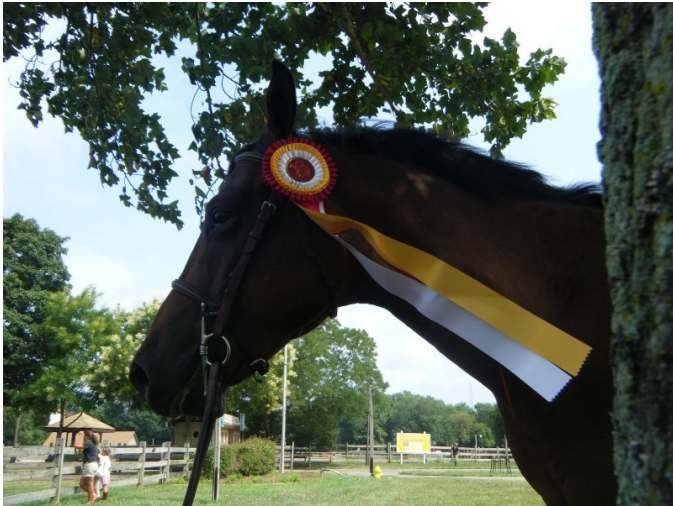
“Posing with a well-earned ribbon”

Trainers & E-Mails..... Is your trainer on our e-mail list? If not, have your trainer send us a quick email since we often have important information going out via e-mail.